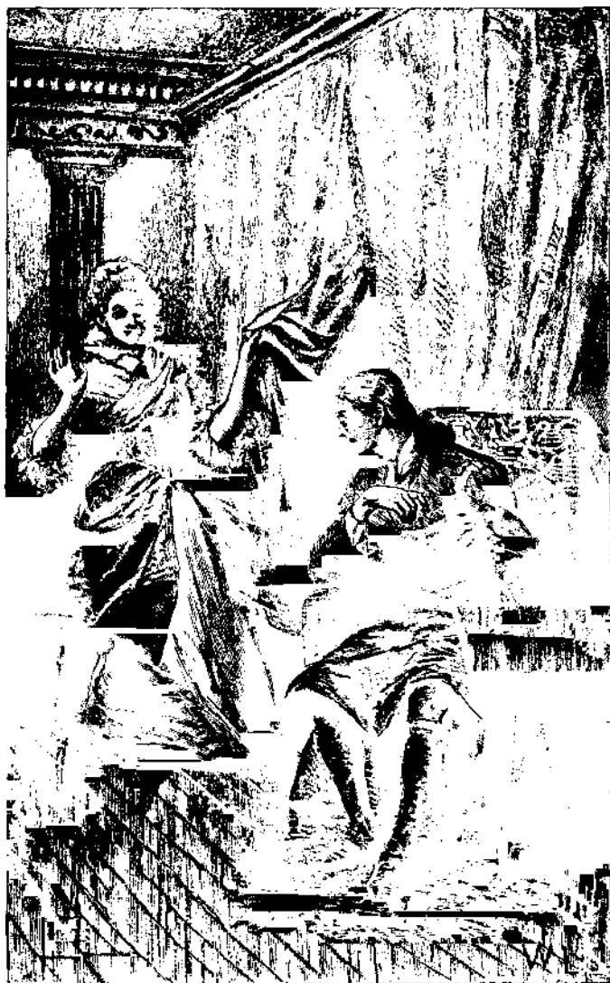
"But when she drew the folds of the bed-curtains, and missed the invalid, thought is not quicker than the motion with which she turned her light person towards the chair." — Lionel Lincoln , p. 222.