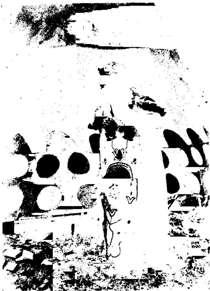
A WOMAN OF THE BLOOD BAND OF BLACKFEET, WITH A CHILD, IN A MOSS-BAG CARRIER