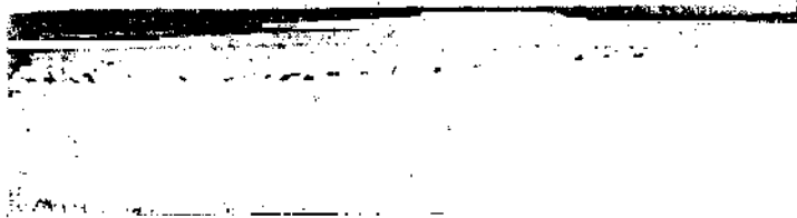
SUN DANCE CAMP, OF THE NORTHERN BLACKFEET