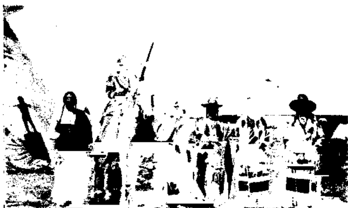
THE FAMOUS HORN SOCIETY OF THE BLACKFEET AT GLEICHEN, ALBERTA