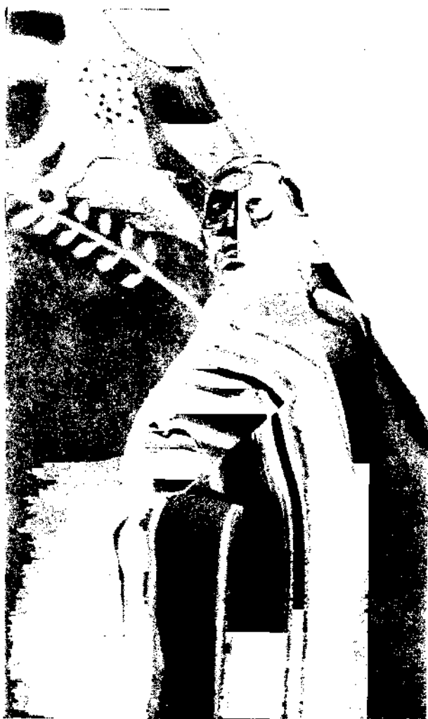
WOLF HEAD A FAMOUS BLACKFOOT MEDICINE-MAN