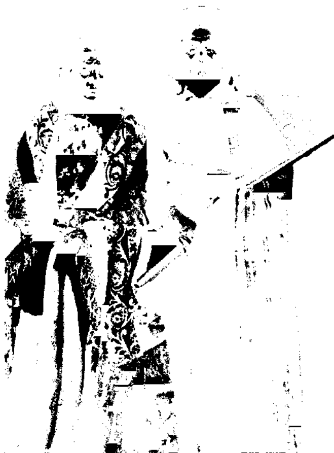
SPOTTED CALF AND SOUNDING SKY PARENTS OF THE HISTORIC INDIAN FIGHTER ALMIGHTY VOICE