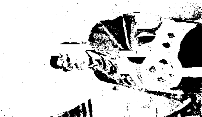
MANY SHOTS, BLACKFOOT, WHO HAS BEEN THROUGH THE SUN DANCE SEVEN TIMES