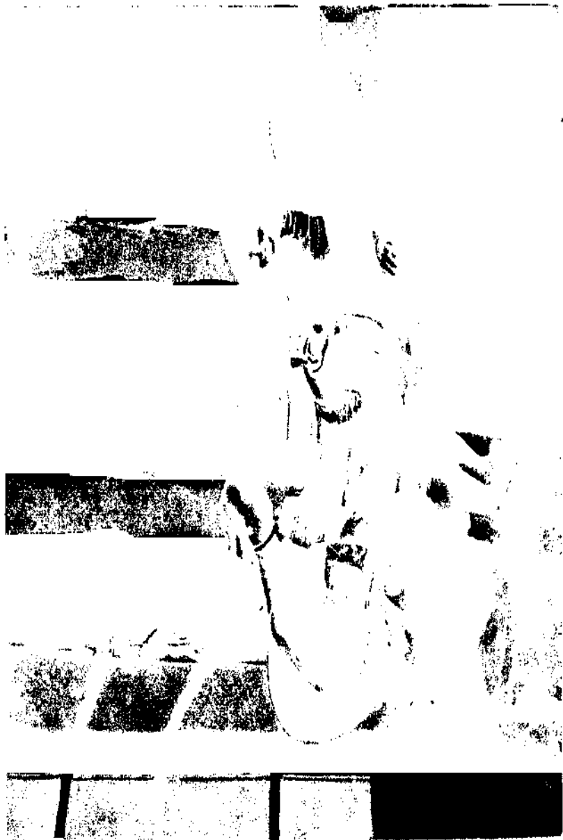
1944-45 The Western Society London