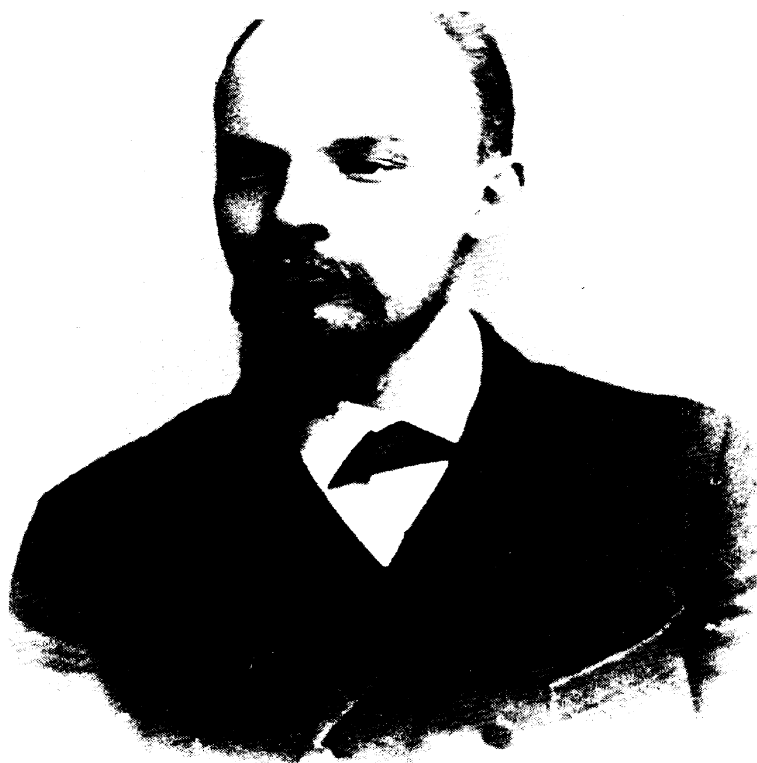
V. I. LENIN—1900