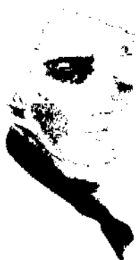
BRIAN HOUGHTON HODGSON 1817 - ETAT 17