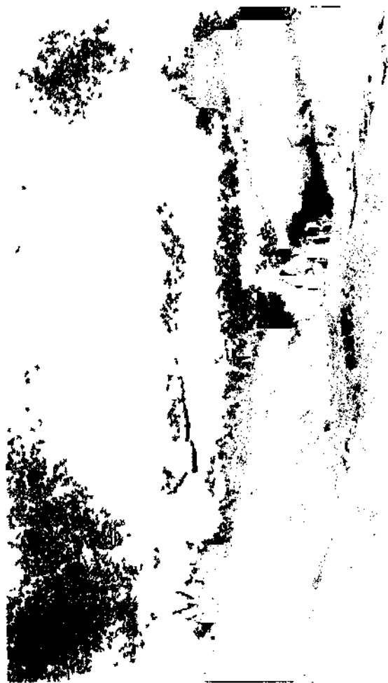
KINCHINJINGA FROM BRIANSTONE DARJILING