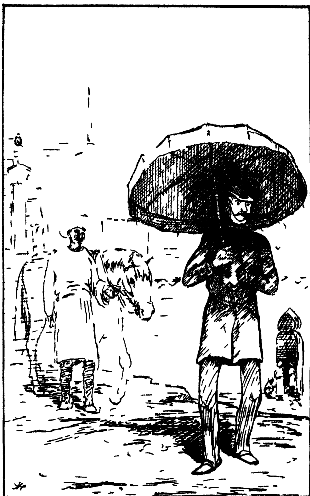
The Old Colonel