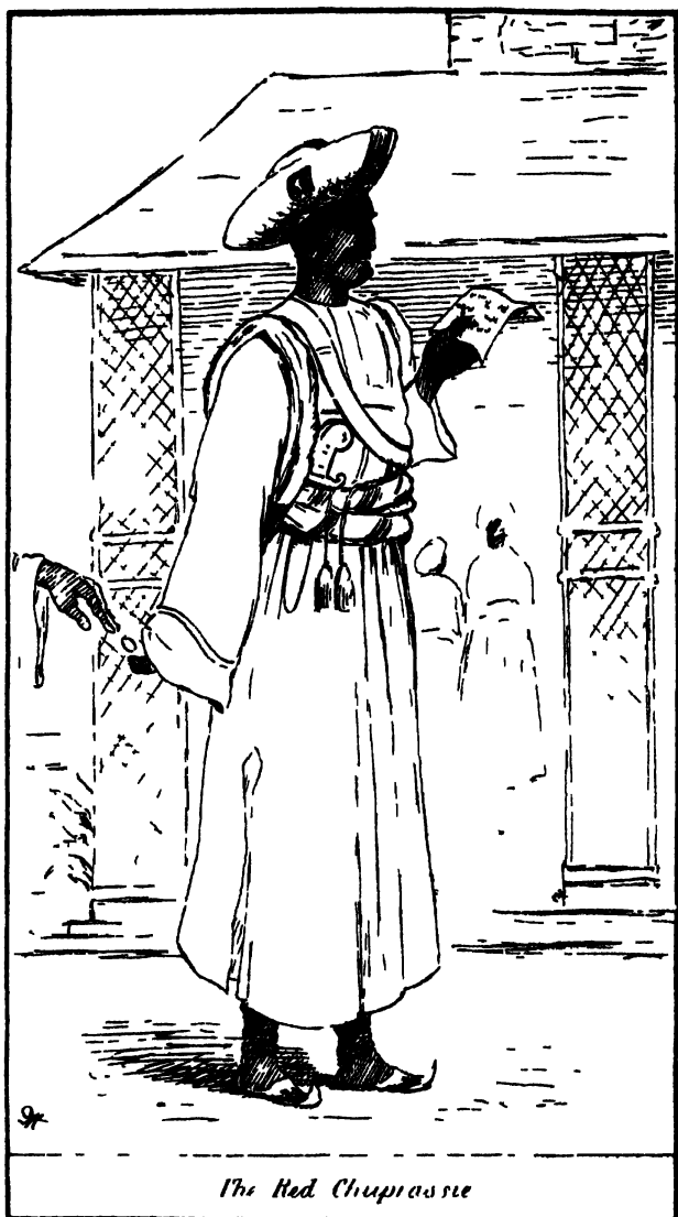
The Red Chuprassee