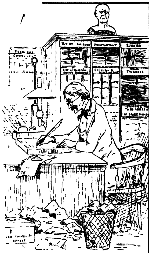
The Secretary to Government