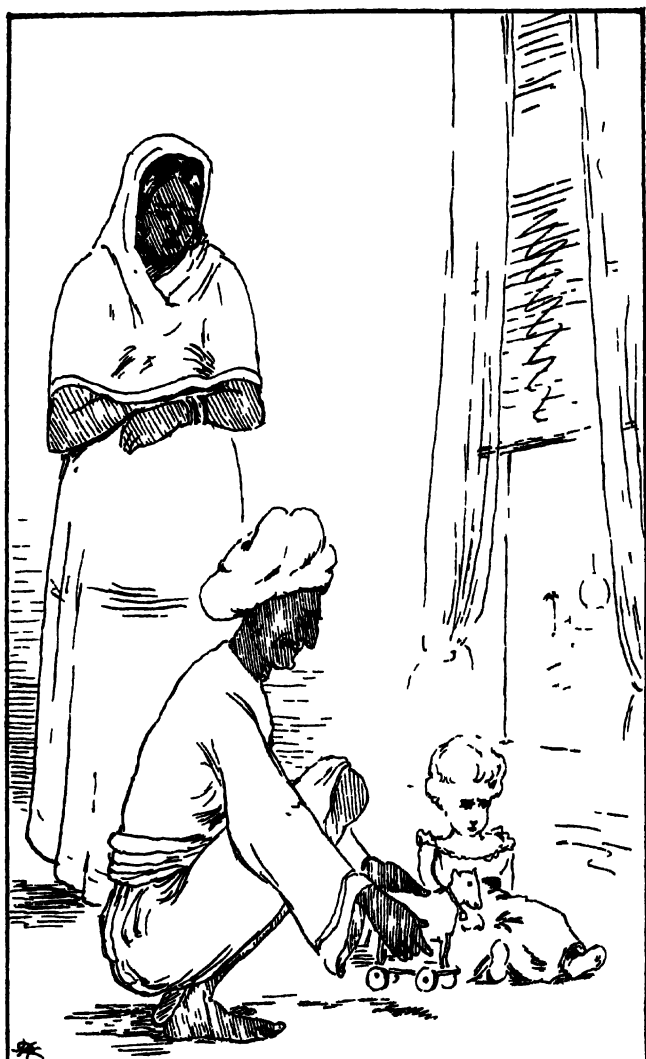
Baby in Parlbus