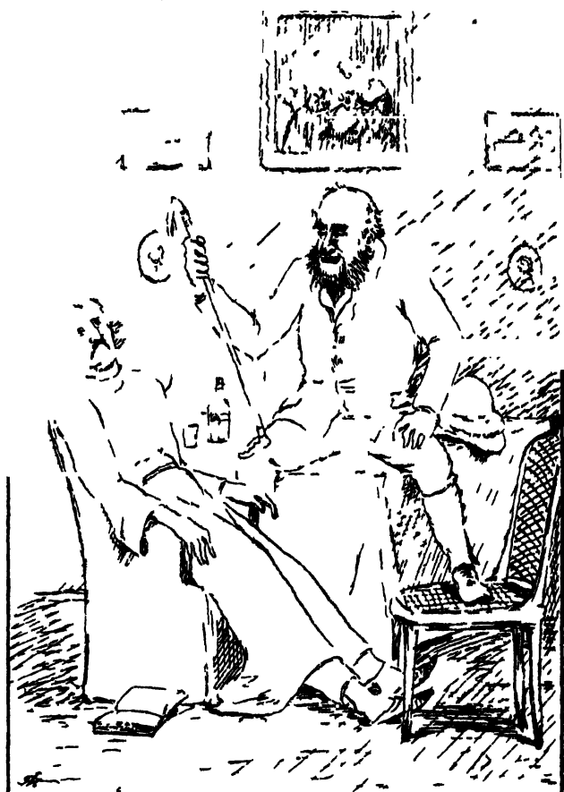
The first Surgeon