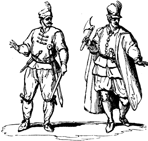
Scappolo or Fallila. See page 184. From TITIAN.

produced by the abandonment of the enterprise was, as we shall perceive, most important to the fortunes of the Republic.