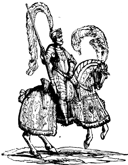
Man at Arms of the XVth and XVIth Centuries, mounted. FROM TITIAN.

and the rich canopy which appertains to Royalty, but he rejected those gaudy trappings as unsuited to his habits; and assuming his Princedom, as he had fought for it, in a Soldier's guise, on horseback, he received the homage of his Citizens, and transferred the Ducal Crown of Milan to the line of THE PEASANT OF COTIGNOLA.