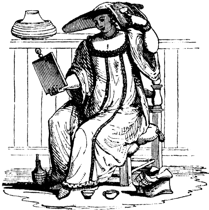
Venetian Lady dyeing her hair. From TITIAN . See page 345.

struggle, than by stating that, even to this hour, after the lapse of more than a century and a half, if a Venetian wishes to imply a "War to the Knife," he proverbially terms it UNA GUERRA DI CANDIA .