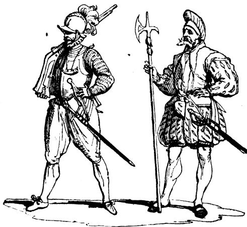
An Arquebusier, p. 29—and a Soldier in Garrison—XVth Century.—From TITIAN.

hollow repose which prepared for them a most fatal War. The seeds of fresh dissensions were to be found in the pride of Maximilian humiliated by defeat, and in the anger of Louis unreasonably kindled by that which he termed desertion ; and the task of reconciling these Princes for the purpose of hostile union against a Government which each regarded with equal dislike and jealousy, required, therefore, but a small portion of Statesmanship. The restless spirit of intrigue which animated Julius II., the most ambitious Pontiff who ever disquieted Christendom, was a fitting instrument to combine against the devoted Republic the first general confederacy which the leading powers of Europe formed on grounds wholly political, and which is known in History as THE LEAGUE OF CAMBRAI.