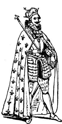
King of France.

Thus, after eight years' uninterrupted struggle, in the course of which at one time all had been lost except her insular dominions, Venice emerged from her mighty dangers; shorn, indeed, of some of her more recent conquests, but still outwardly powerful and largely increased in glory. Her firmness and her prudence had saved her while tottering almost on the verge of ruin, and never did she exhibit herself in a prouder attitude than that which she calmly maintained under the heaviest pressure of her late complicated disasters. Over these she had at length triumphed; her immediate losses were Cremona, the borders of the Adda, and Romagna; her future dangers arose from the neighbourhood of Powers superior to herself, and from the burden of a National Debt, incurred for the support of the past exhausting war, and amounting to five millions of ducats, a sum nearly equalling eight millions sterling of our present money.