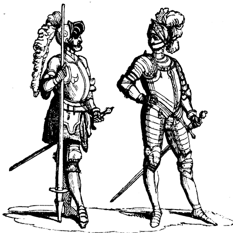
Men at Arms of the XIVth and XVth Centuries. From TITIAN.

the miseries endured by Italy during the existence of the Condottieri . It would indeed be difficult to select any passage from the whole range of poetry in which truth is more closely intertwined with imagination, than in that magnificent chorus by which Manzoni has concluded the second Act of IL CONTE DI CARMAGNUOLA *.