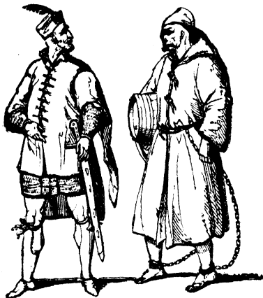
Chief of the Uscoochi, p. 361. Sforzato, or Galley-slave. FROM TITIAN.