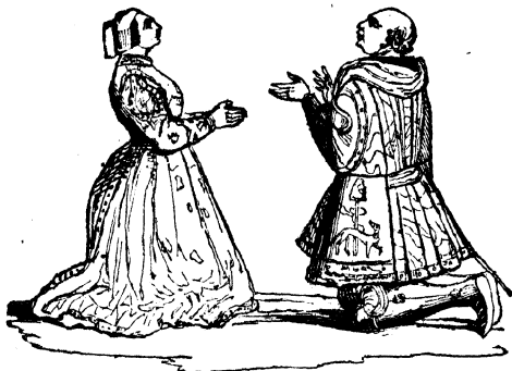
Francesco and Bianca Sforza. From their Tomb at Milan.

of the siege. They were distributed by the Signory of Venice through various parts of its territory, and rewarded, as their rare fidelity well deserved, either by public charges or by allowances from the State.