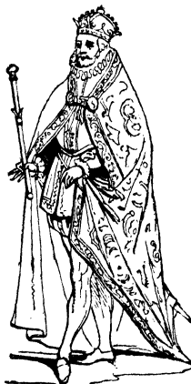
King of Spain.