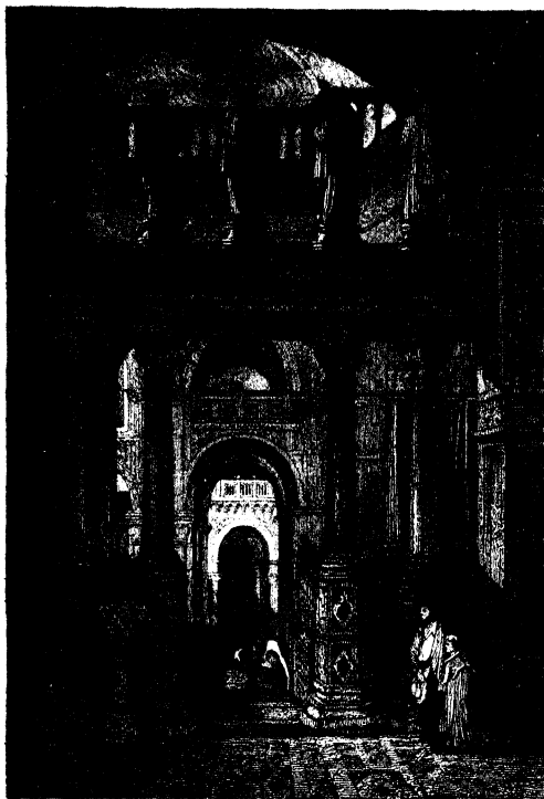
Entrance to the Court