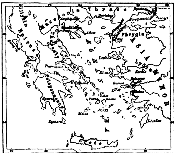
GREEK AND THE TROJAN COASTS

purple dye for hangings and for great men's robes from the shell of a little sea-creature, and how to dig mines and to work metals (2 Chronicles iii. 3, 7 ; Esther viii. 15). When the best trees in the forests of Mount Lebanon were cut down, and the Phœnicians had to go in search of wood for their ships, they found abundance of oak, pine, and beech on the shores of the Ægean Sea . They discovered that the root of the Greek evergreen oak could be used for tanning,