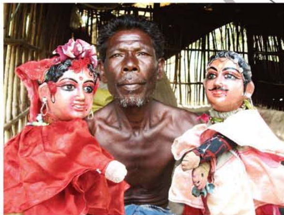
"Dastana putul nach"

All Research Fellows and some officials were on a sixty day field tour to collect anthropometric measurements and