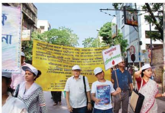
Anthropological Survey of India, participating a rally to mark the World Thalassemia Day