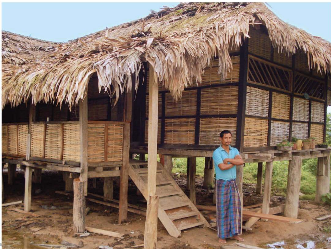
Traditional house of Tai Khamti, Lohit district, Arunachal Pradesh

A nationwide programme was undertaken by the An.S.I., as part of its twelfth Plan Research Projects, for a study of the Particularly Vulnerable Tribal Groups (PVTGs). A large number of researchers from Head Office, Regional Centres / Sub-Regional Centre and Field Stations have conducted fieldwork among all the 75 PVTGs across the country. The larger aim of the undertaking is to collect grass-root level information on aspects like health,