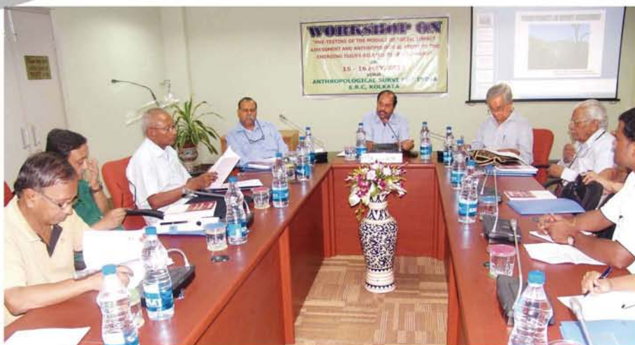
Director along with the experts during the workshop on "Pre-testing of the Module of Social Impact Assessment"

After the completion of field work among the Particularly Vulnerable Tribal Groups (PVTGs), a work shop on PVTGs was held from 18th to 20th June at the Eastern Regional Centre of Anthropological Survey of India, Kolkata. All presentations were discussed threadbare and are being finalized for a final report.