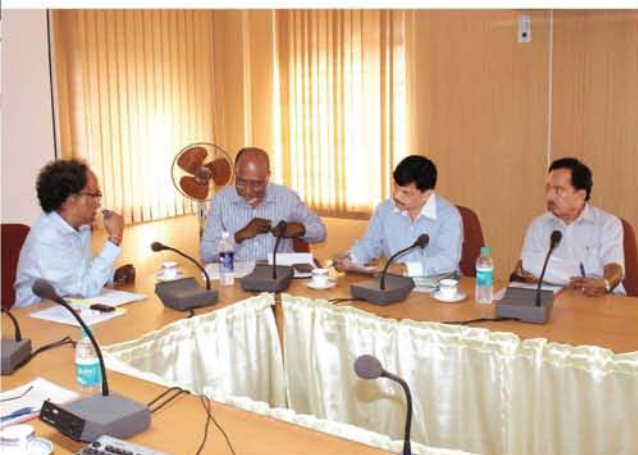
Consortium Meeting in progress, Southern Regional Centre, Mysore

Thalassemia with special reference to the tribes of West Bengal organized by the Netaji Subhas Chandra Bose Cancer Research Institute in collaboration with DBT at Swabhami.