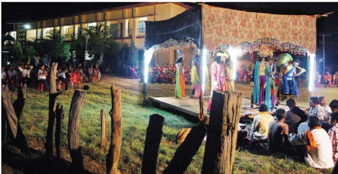
Bhatra Naat during the International Museum Day Celebrations.

Local Medical staff, ICDS Department, Block officials and traditional/ community tribal leaders have provided assistance for the successful organization of the camp.