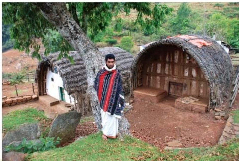
A Toda man in traditional attire in front of the famed dairy temple of the Todas.

Completed the first phase of documentation work on Patachitra of Odisha in connection with the Visual Anthropology project.