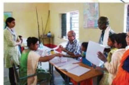
"Screening for Sickle Cell Anaemia and Awareness for Prevention" Camp.

Anthropological Survey of India, Sub-Regional Centre, Jagdalpur celebrated International Museum Day from 18th to 19th May, 2011 on the theme "Museum and Memory" as selected by the ICOM. Besides a photography exhibition on the theme "Memories of Zonal Anthropological Museum, Jagdalpur", 50 rare museum specimens were also on display during the celebration. Performance of Bhatra Naat and a folk dance of Dhurwa were a part of the