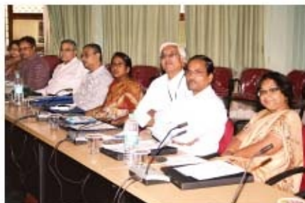
Some Executive Committee members.

Other important points discussed during the meeting include holding National /