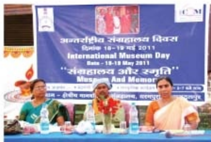
During the inauguration of the International Museum Day.

International Seminar, Orientation Courses, Refresher courses and the activities of the School of Anthropology during the year 2011-12, updating of the Survey's Website, bringing out regular Newsletter, printing of Brochure for the Survey, and making of a ten minute Documentary Film, etc.