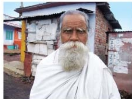
A Kota priest in Sholur Kokkal