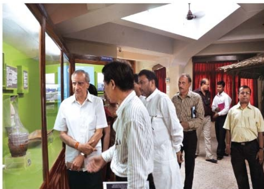
Study visit of the Parliamentary Standing Committee on Transport, Tourism & Culture to the Zonal Anthropological Museum, An.S.I., Andaman & Nicobar Regional Centre, Port Blair. Prior to their visit to the ZAM, the Department related Parliamentary Standing Committee inspected the role of An.S.I. in tourism related activities at Megapod on June 30, 2011.

The first Executive Committee Meeting of the Financial Year 2011-12 was organized at the Western Regional Centre, Udaipur and all Heads of Offices of different Regional Centers attended the meeting on the 9th and 10th April, 2011. Compliance Report of the Executive Committee meeting held at Kolkata on 12th and 13th January 2011 was presented. Status reports of the different national projects and budgetary estimates for the financial year 2011-12 were also presented during the meeting. Organizational review and restructuring, including revision of Recruitment Rules were discussed. One