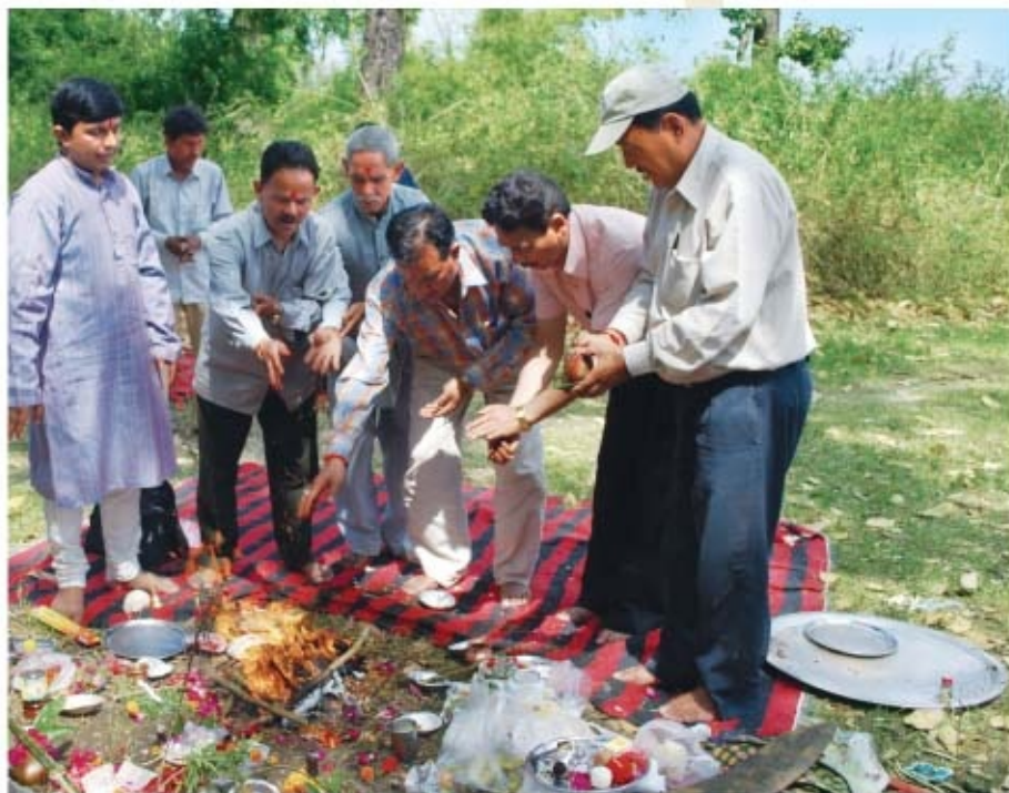
Sansari Mata Puja performance by the Gurkha.

and somatometric measurements. Blood samples were collected and tested for blood group identification, haemoglobin and blood sugar level. DNA was extracted for further studies.