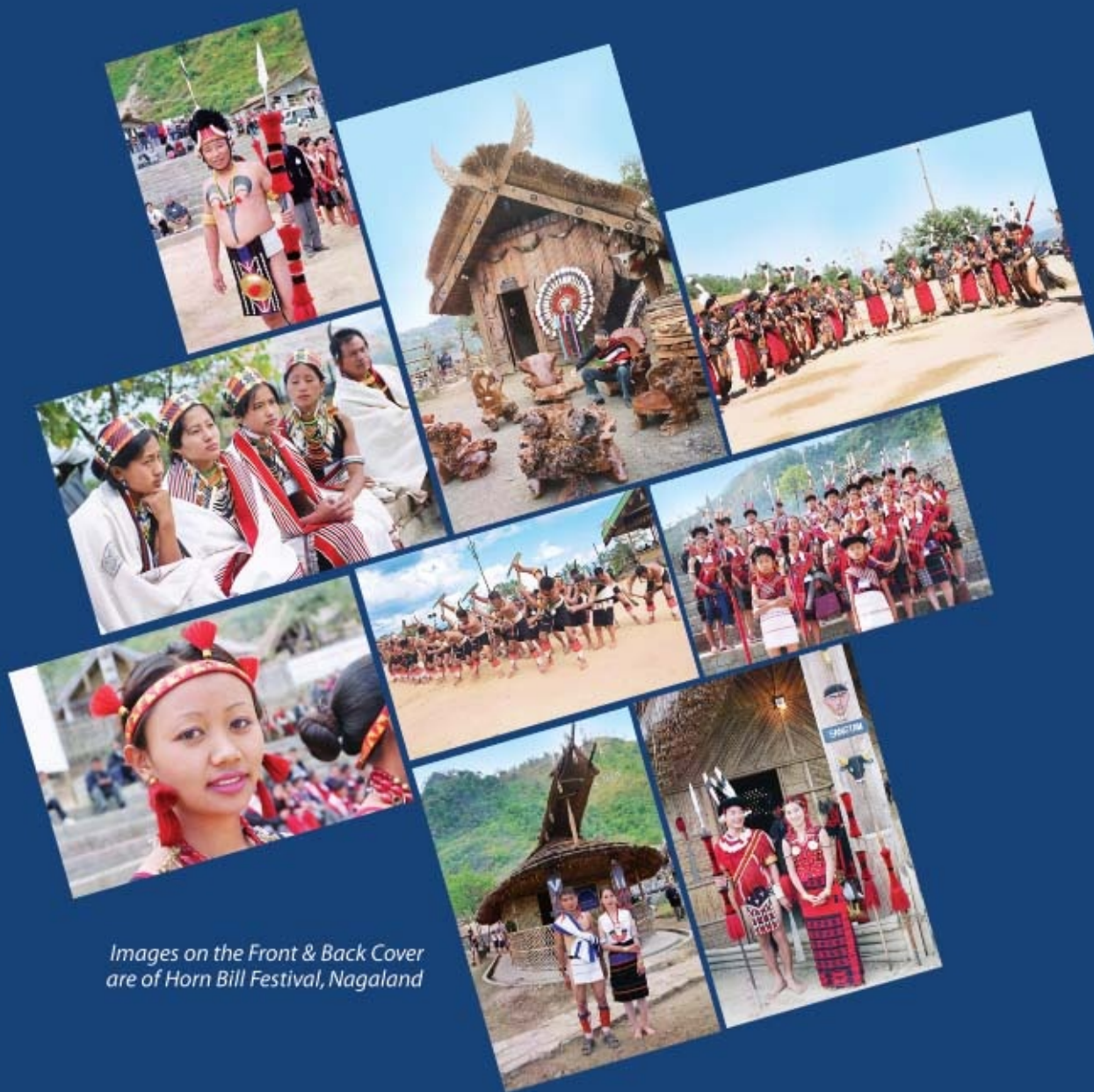
Images on the Front & Back Cover are of Horn Bill Festival, Nagaland