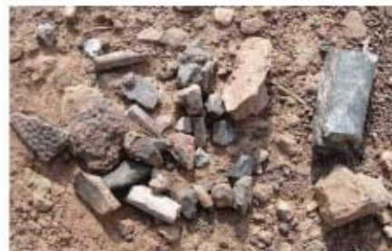
Fossils and Palaeolithic Implements recovered during Explorations in the Siwaliks.

Some remains of fossil fauna were discovered which include aquatic as well as mega terrestrial ones bearing the palaeo-environment of the hominoid ancestors. In addition, a Palaeolithic Chopper was discovered, away from its factory site along the Beas-Banganga river terraces, known to have yielded many Palaeolithic implements earlier.