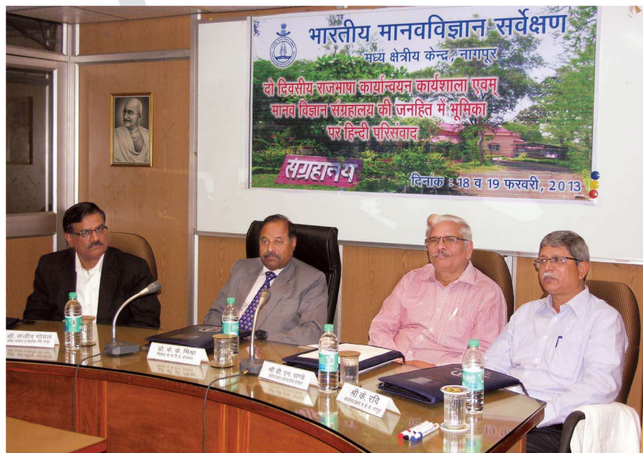
During the National Hindi Seminar and Hindi Karyashala on "Manav Sanghralaya ki Janhit Main Bhumika", CRC, Nagpur