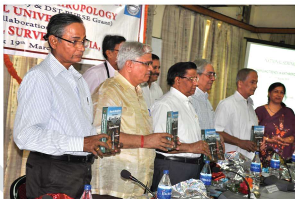
Simlipal Biosphere Reserve book release, Bhubaneswar