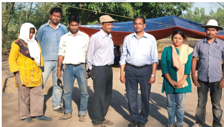
Paleo - Anthropology Team in Bankura

Final report on the Angami Naga children has been submitted.