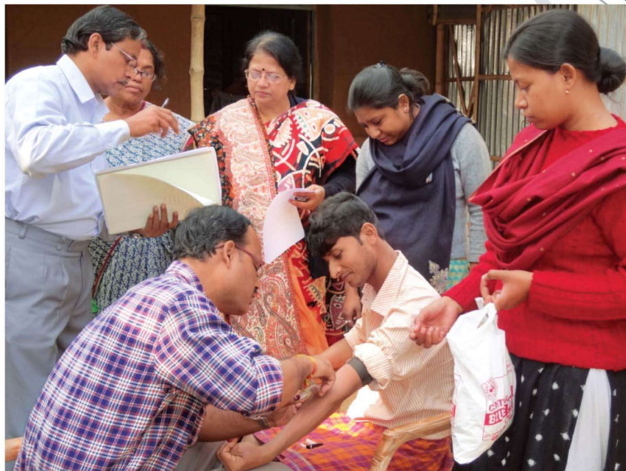
Collecting data and blood samples from Kamal Ghat village, West Tripura