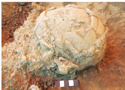
Excavation site at the Bankura

A team of researchers attended a week long on-the-site hands-on-training Workshop at an ancient pre-historic Acheulean site at Tikoda, Raichur district