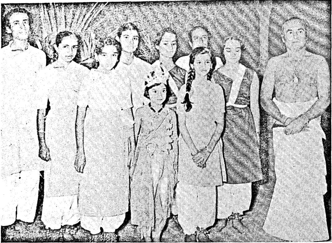
A group photograph of the students who joined the Kerala Kala Kendra, New Delhi, on the opening day. Guru Gopinath, Principal of the Kendra, is seen at extreme right

session. In the concluding session of the festival on September 1, T. K. Jayarama Iyer (violin), Alla Rakha (tabla) and Ravi Shankar (sitar) gave memorable recitals.