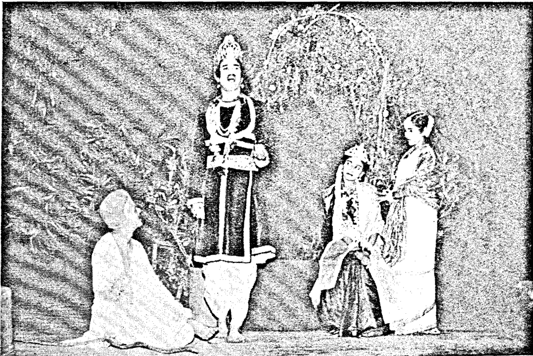
A scene from "Nagananda" staged in the Bharatiya Vidya Bhavan Kala Kendra Inter-Collegiate Drama Competition held in Bombay recently

The winning college presented Vigil , a one-act play. Three colleges participated in the competition—K. C. College, Wilson College and Elphinstone College.