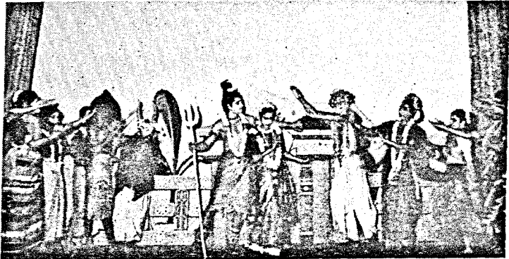
A Scene from " Kumar Sambhav "