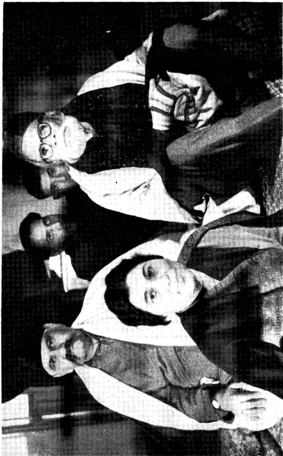
Shri Mustaq Husein Khan and Shri Bade Gulam Ali Khan