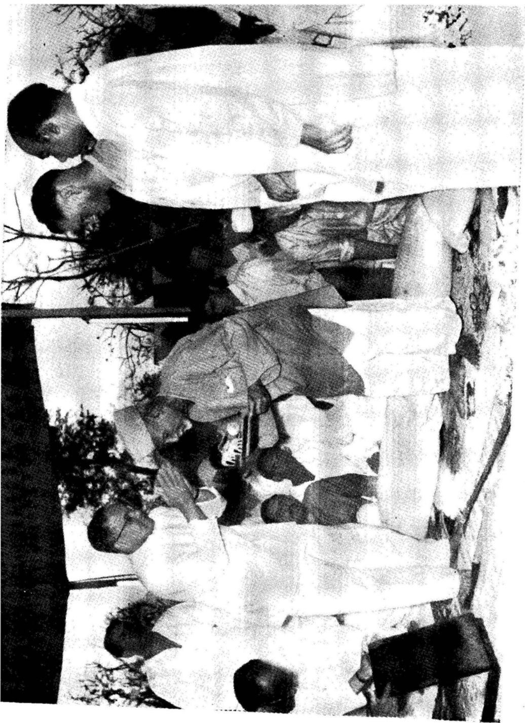
Scroll being presented to Ustad Allauddin Khan