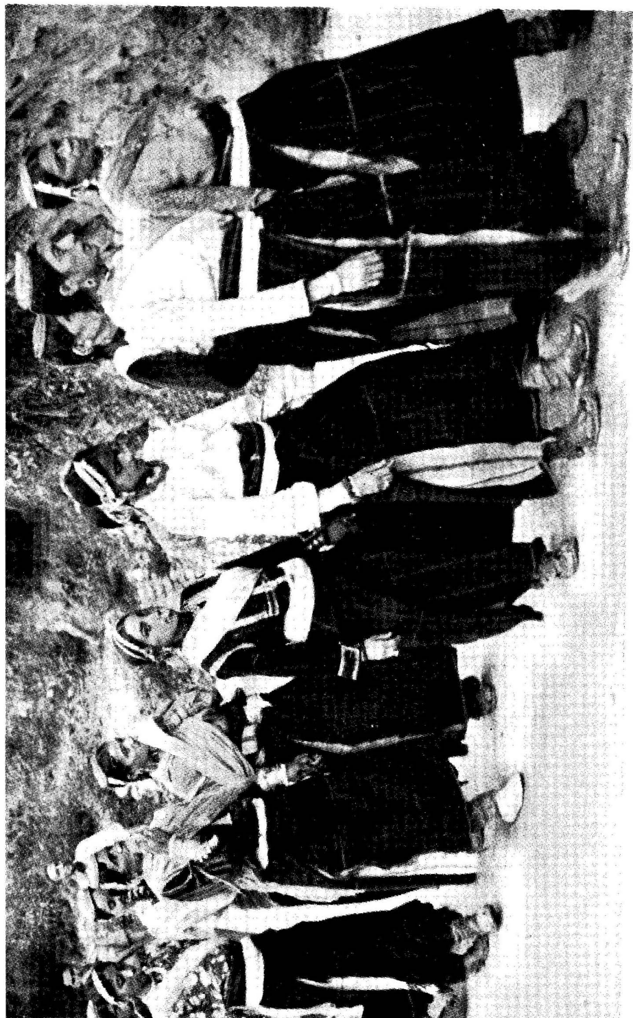
Folk Dance as in Minjar Procession