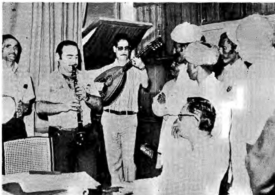
Workshop of Greek and Indian Folk Music organised by the Akademi.