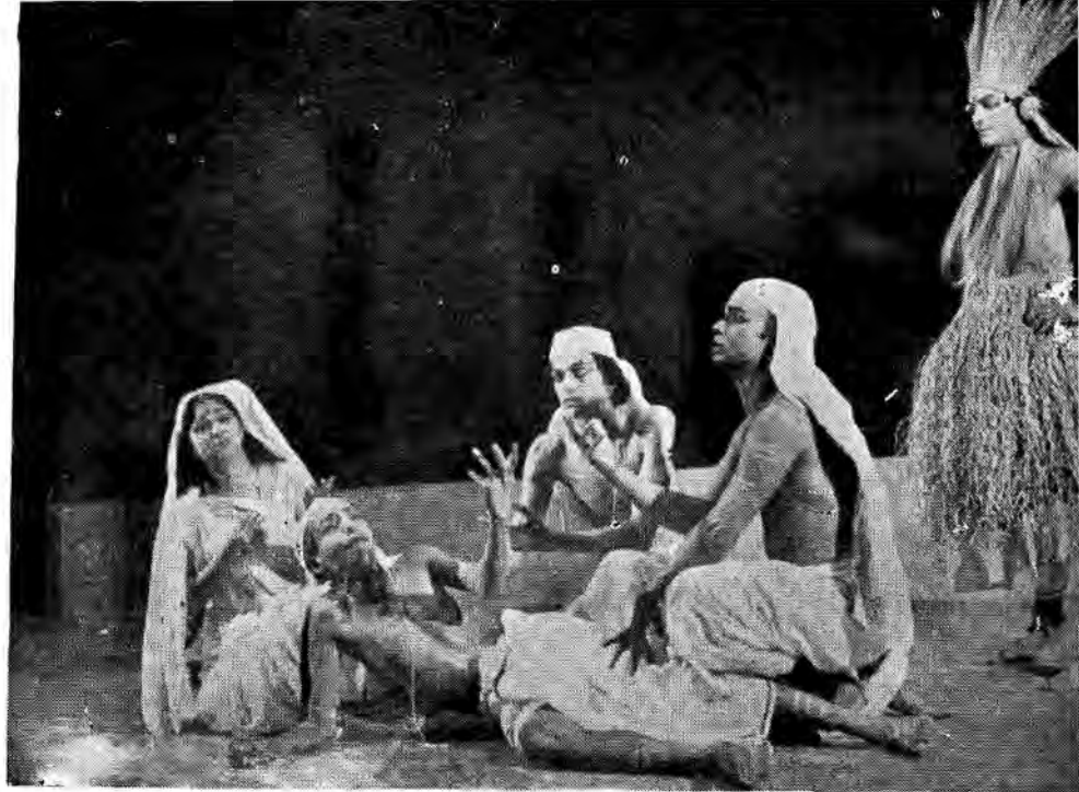
Contemporary Sanskrit Play 'Madhyama Vyayoga' presented by the Akademi.