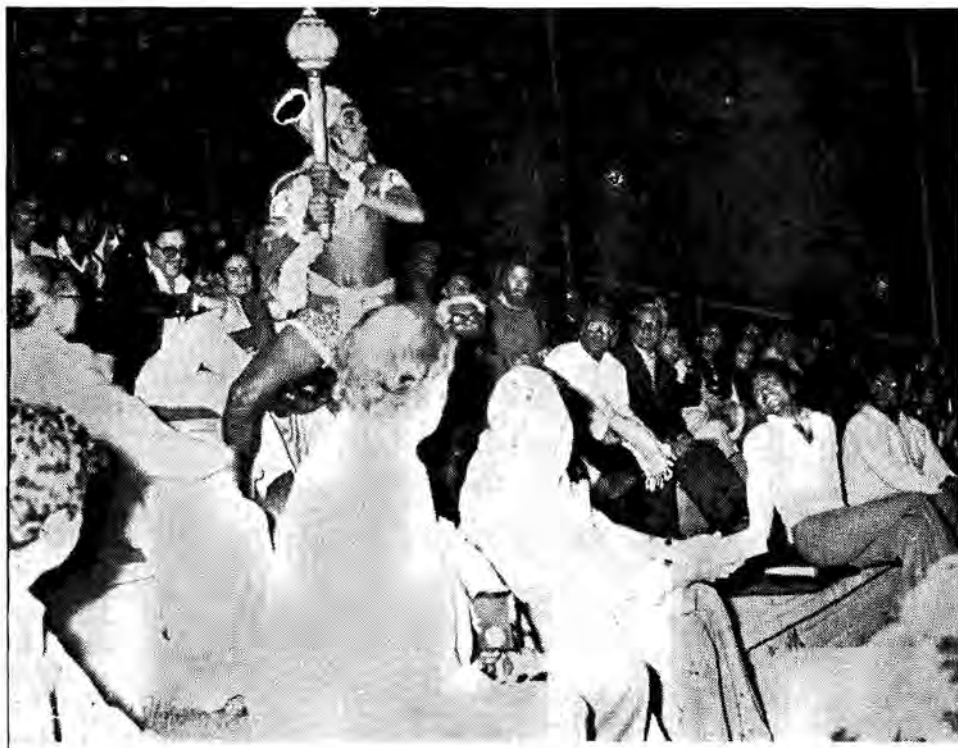
One of the 'Rare Forms' presented by the Akademi. Ranmaley of Goa.