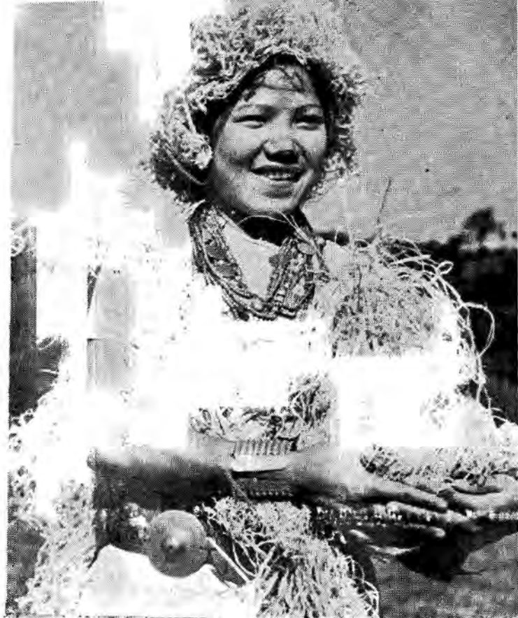
Nishi Tribal Dance of Arunachal Pradesh Khampti Mask Dance of Arunachal Pradesh