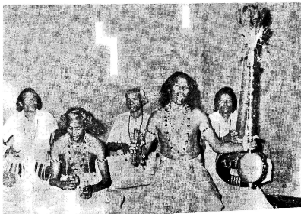
Pandvani of Madhya Pradesh.