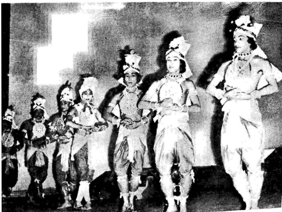
Awards Festival - 1980. Contemporary Manipuri Dance Choreographed by Shri R.K. Priyagopal Sana.