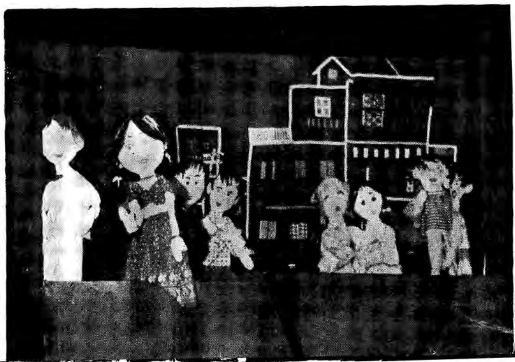
Contemporary Puppet Theatre Festival - 1980. 'Ame Nane Bai' by Darpana.