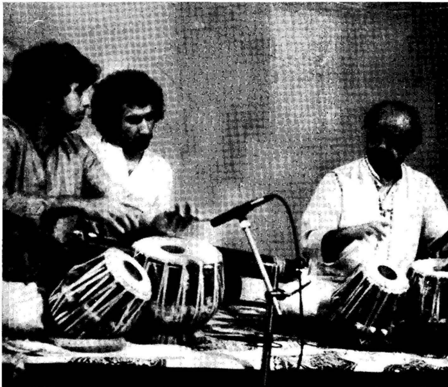
Tabla-players Zakir Hussain and Alla Rakha (first and third from left), recorded in the Akademi studio