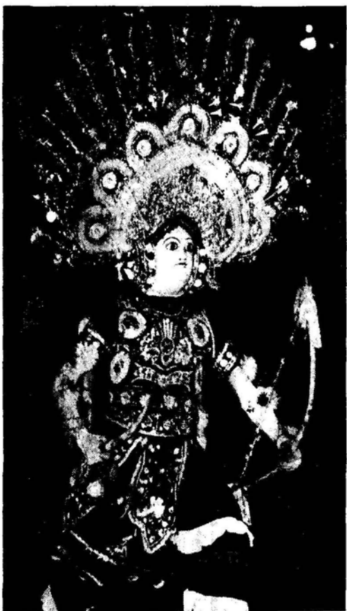
Chhau, Purulia : Indian Chhau Dance Party Youth Association, Lok Utsav '87, Delhi