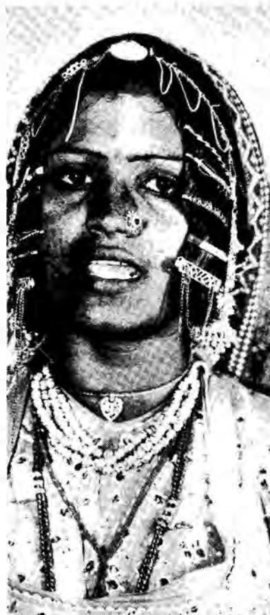
Kalbelia singer : Lok Utsav '88, Delhi.