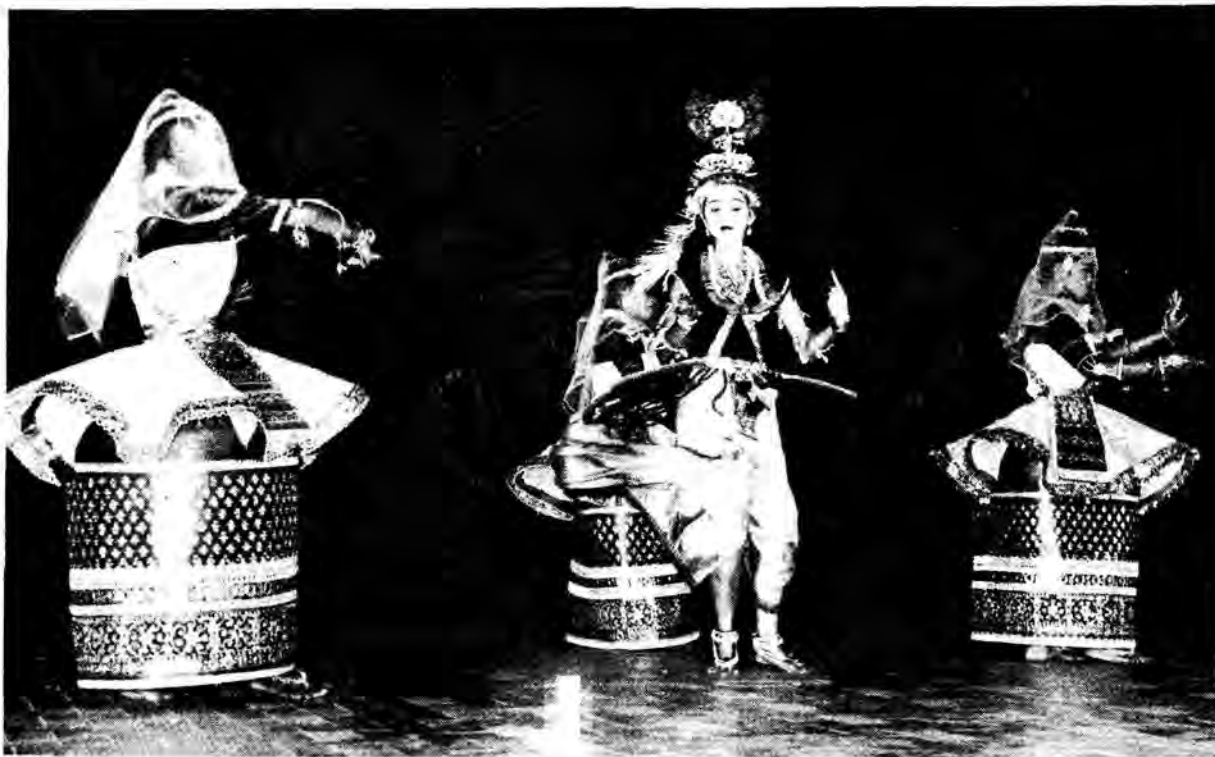
Manipuri : Nrityotsava, Hyderabad.