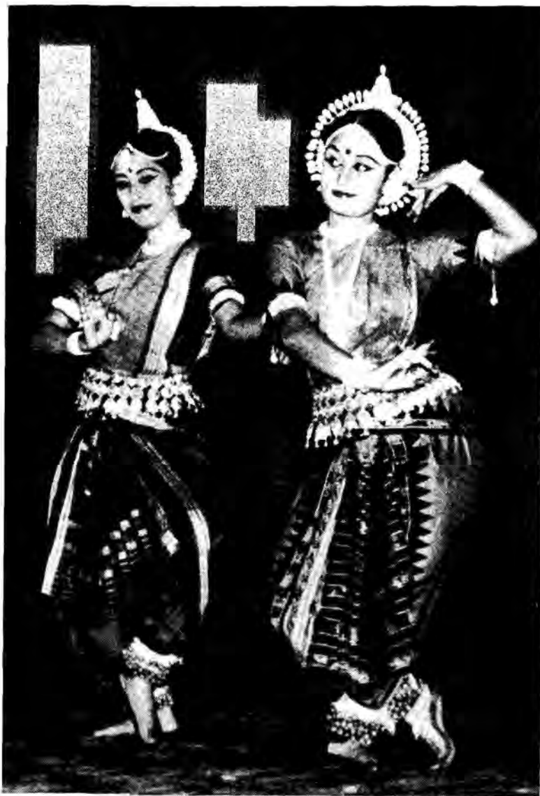
Odissi - Nrityotsava, Hyderabad.