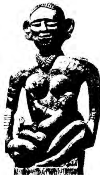
Mother-and-child emblem : Lok Utsav '88, Delhi