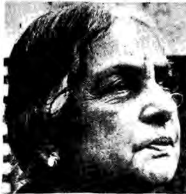
Kamaladevi Chattopadhyay , former Chairman of the Akademi and a leading figure in Indian arts and crafts, died in Bombay on 29 October 1988; she received the Akademi Fellowship in 1974.