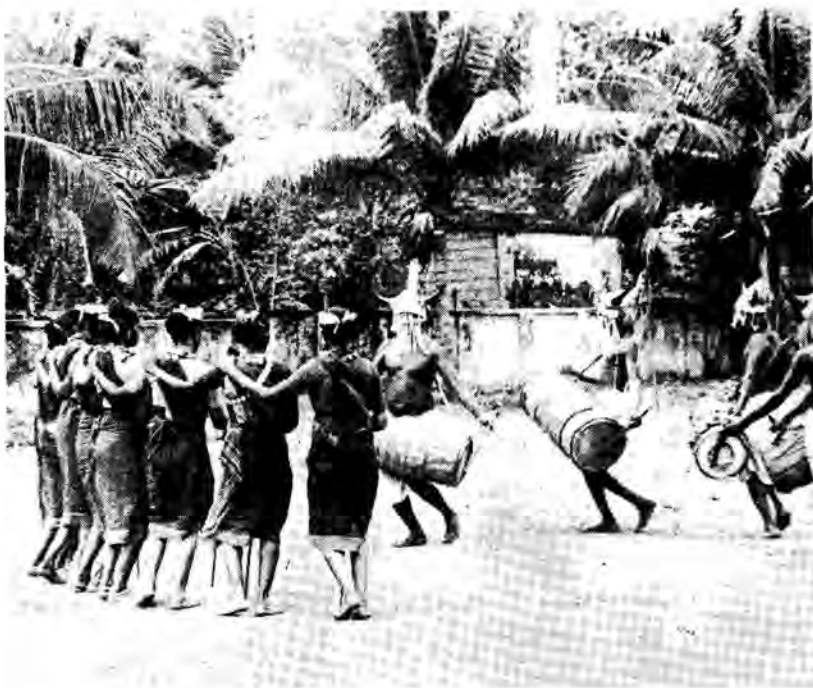
Dance of the Koyas : Lok Utsav, Bhubaneswar.

Singh Baja, Kalhandi; Jhoomar dance, Mayurbhanj; marriage dance (Kol tribe), Mayurbhanj; Dhap dance (Kutia Kondh tribe), Kalahandi; Dhol Mahuri, Bhadrak; Bharat Leela, Ganjam.