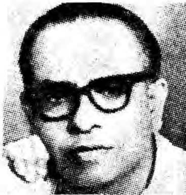
N Krishna Pillai , noted

Malayalam Playwright, died on 10 July 1988; he received the Akademi Award in 1978.