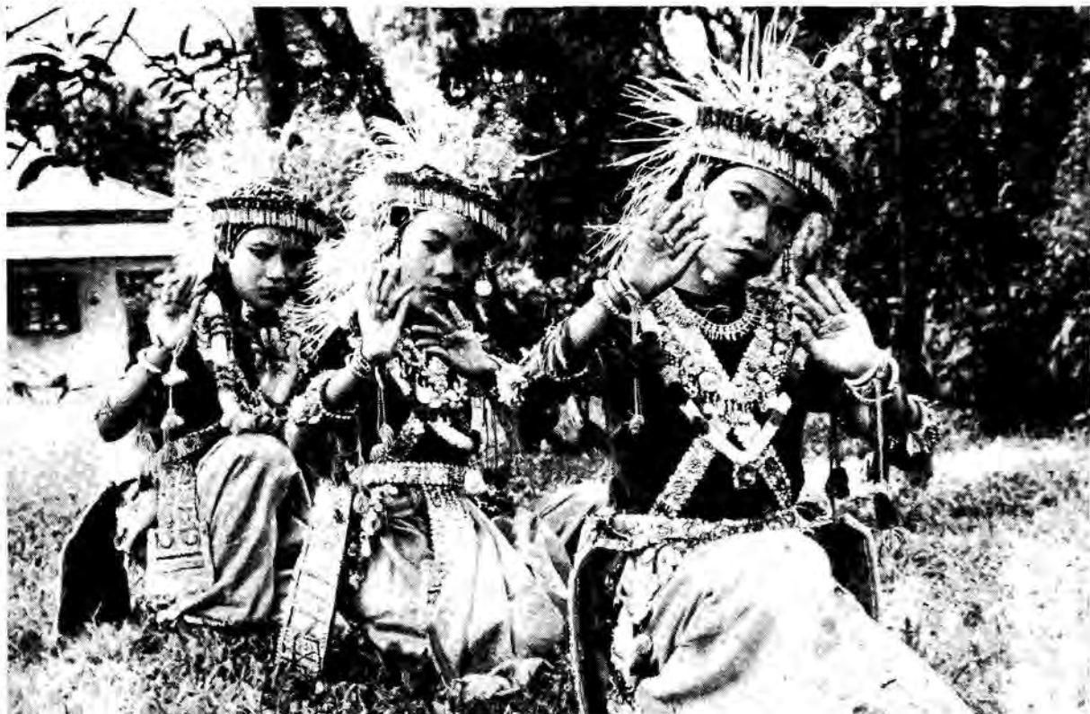
Young students at JNMDA.