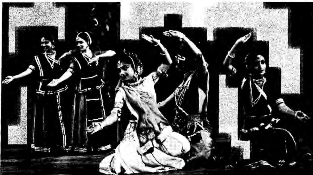
A Kathak Kendra dance-drama.