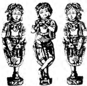
Emblem for Nrityotsava - Hyderabad