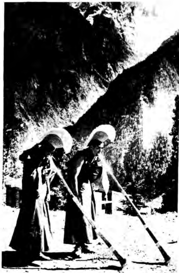
Lama musicians of Kinnaur, Himachal Pradesh, recorded for Akademi archives.