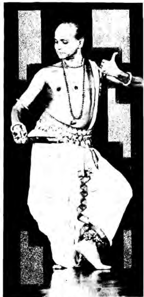
Guru Kelucharan Mohapatra : Festival of India, Japan.