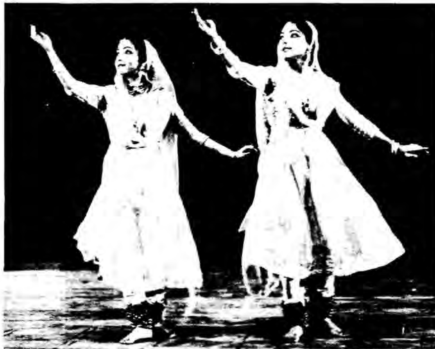
Kathak : Festival of India, Japan.