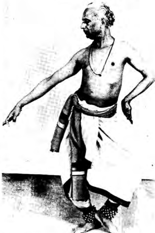
Kuchipudi guru Vempati Chinna Satyam, video-filmed in the Akademi studio.