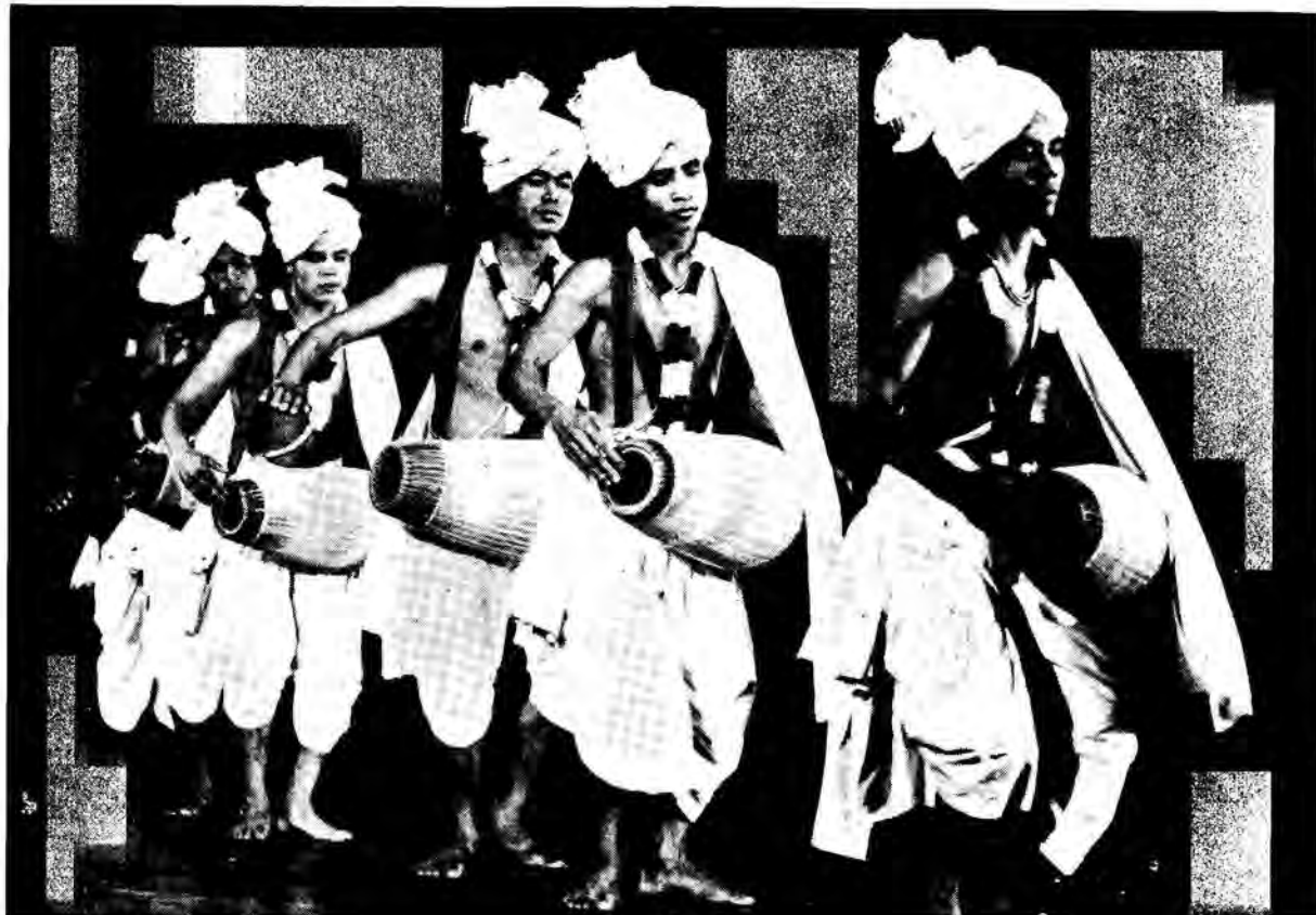
Pung Cholom : Festival of India, Japan