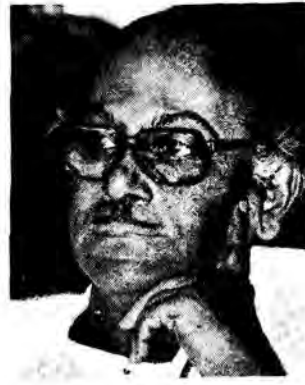
Lalchand Yamla Jat Allah Jilai Bai Salil Chowdhury