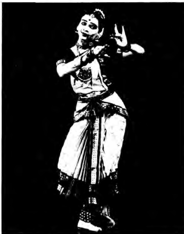
Malavika Sarukkai : Festival of India, Japan.