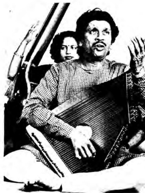
Ustad Ghulam Taqi Khan, Hindustani vocalist, recorded in the Akademi studio.

Akademi's documentation unit, augmented by copies from diverse sources. By way of dissemination of the material collected, the Akademi offers at nominal cost copies of all photographic material, audio/video listening/viewing facilities, music-dubbing and film projection facilities. Material from Akademi archives has been extensively used in publications, films, television, as well as research on the performing arts of India. New audio/video recordings in 1988-89 are listed in Appendix IV.