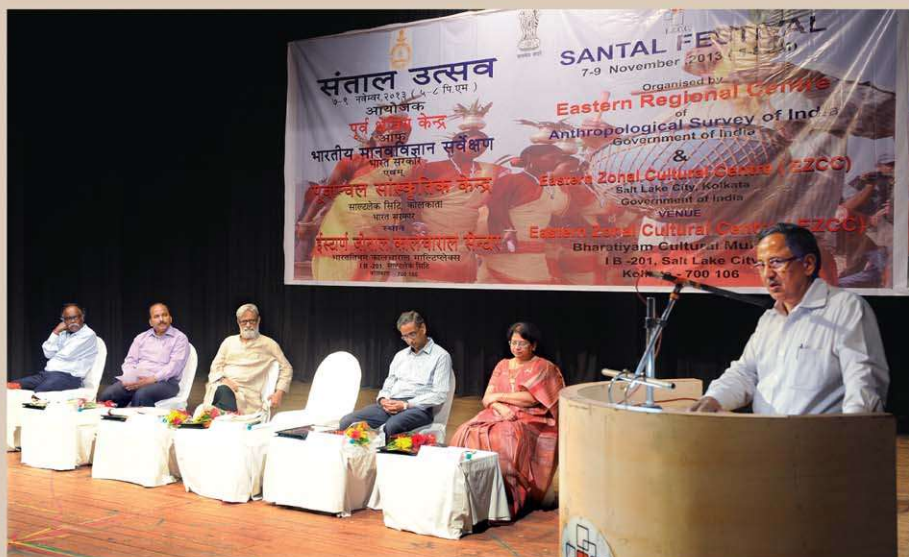
Shri G. S. Rautela, Director of the Anthropological Survey of India addressing the audience during the Santal Cultural Festival in Kolkata

Anthropological Survey of India organized an exhibition "People of India" showcasing posters, panels, artefacts, stone tools and museum specimens including interactive modules at the Kasturbachand Park, Nagpur on the occasion of Silver Jubilee Celebration of the Zonal Cultural Centres, from 10th to 16th November. The exhibition was well received by more than 25,000 visitors including students from schools and colleges. The Secretary, Govt. of India,