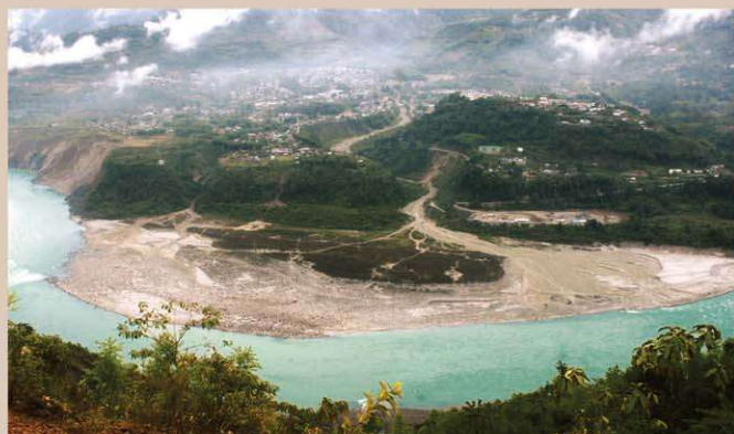
An arial view of the Dihang Dibang Biosphere Reserve of Arunachal Pradesh

Preliminary results of the Health awareness camp organized on the 4th of August by the Southern Regional Centre, Mysore in collaboration with Swami Vivekananda Medical Mission, Agali and PSG Medical college, Coimbatore in the tribal hamlet of Elachivazhi of Agali Block, Attappady taluk in Kerala reveal that a good number of children were either in Grade-I or Grade-II malnutrition (57 cases). A few cases of Goitre, Tuberculosis and Sickle Cell Anaemia were also reported. Solubility test for Sickle Cell detection indicates that about 20% were carriers and a case of strong homozygote.