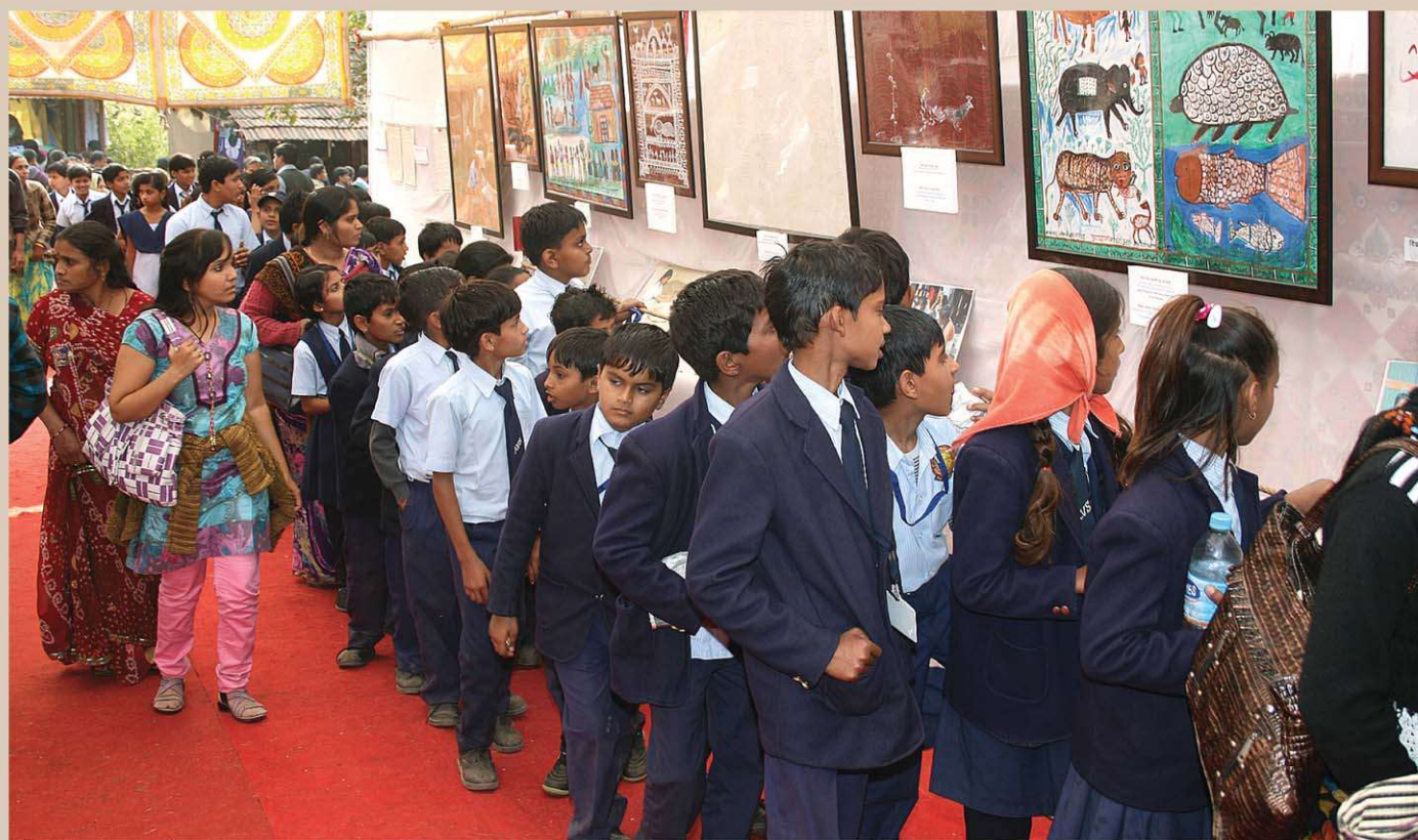
School children as well as elderly men & women including the tourists thronged the exhibition "Adi Chitra" in the Shilpagram Utsav in Udaipur

Four scientific officers delivered lectures on Anthropology and allied disciplines and imparted hands-on- training to some child scientists on 21st & 22nd December during a three week internship by DST, Government of India at the IIT, Kharagpur, West Bengal.