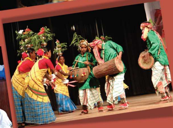
Front Cover: A Dhamal performance by Sidi Goma group of Ratanpur, Bharuch district, Gujarat.