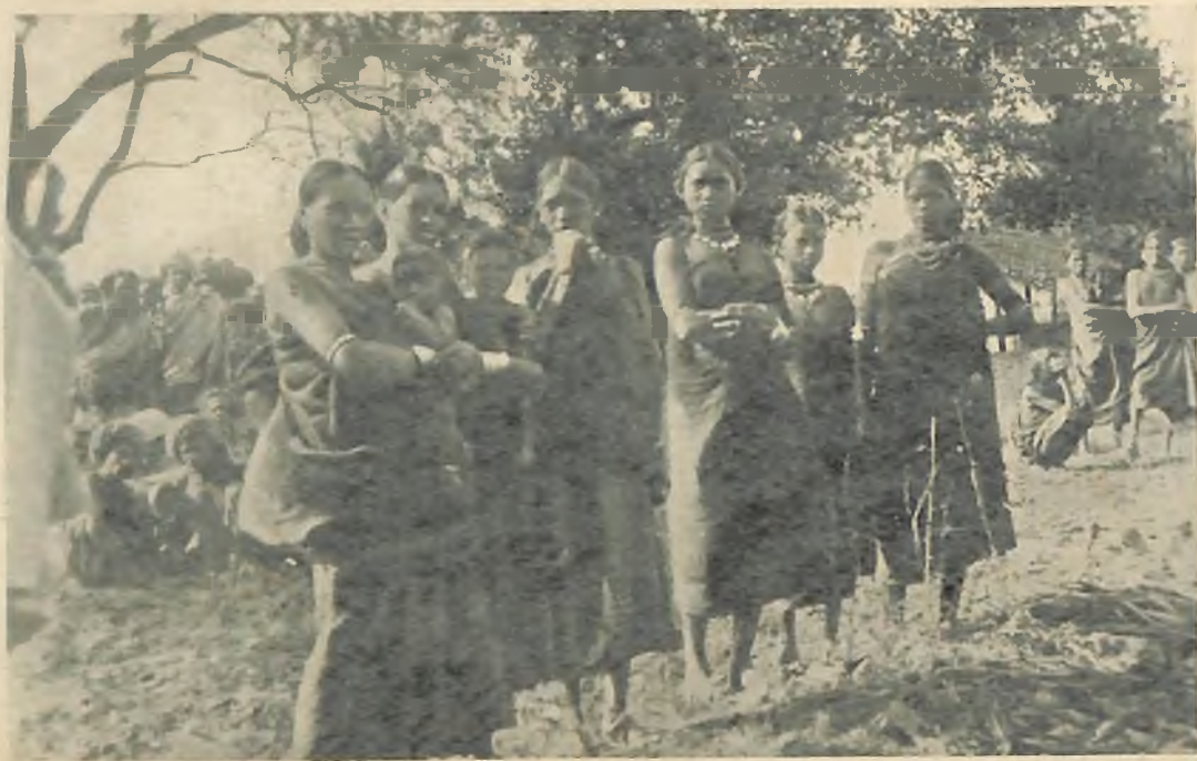
A GROUP OF PAHARIA WOMEN