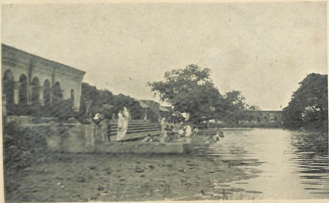
THE BATHING-GHAT BY THE SIVAGUNGA AT DEOGHAR