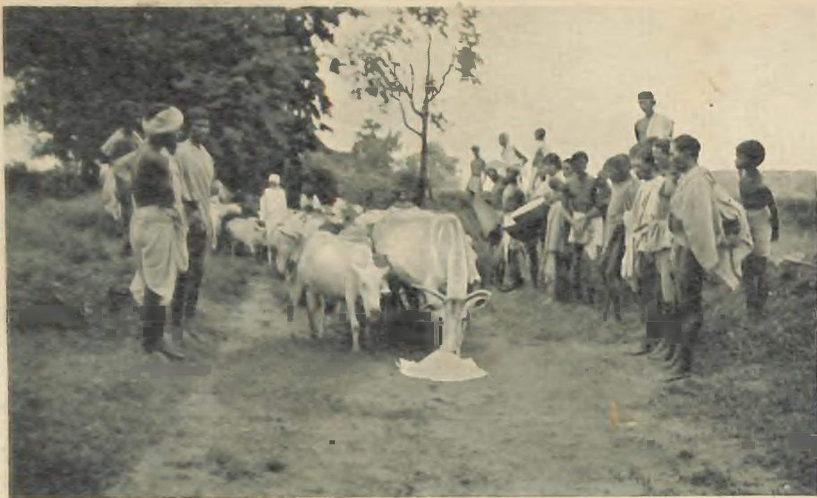
THE TRIAL OF LUCK DURING THE SOHRAE