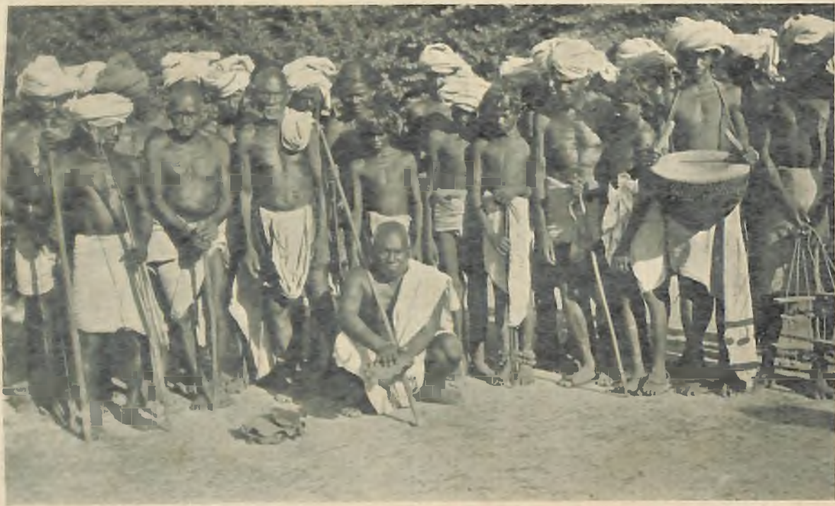
AN OJHA DIVINING BY MEANS OF SAL LEAVES