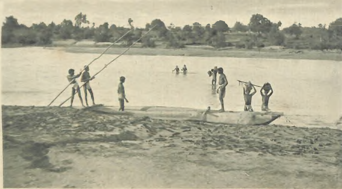
A FERRY ON THE BARAKAR RIVER, WHICH SEPARATES THE SANTAL PARGANAS FROM CHOTA NAGPORE