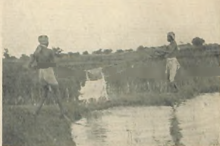
A PRIMITIVE MODE OF IRRIGATION