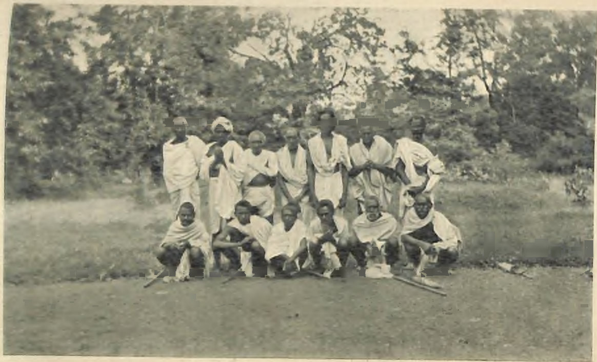
A GROUP OF SANTAL MANJHIS