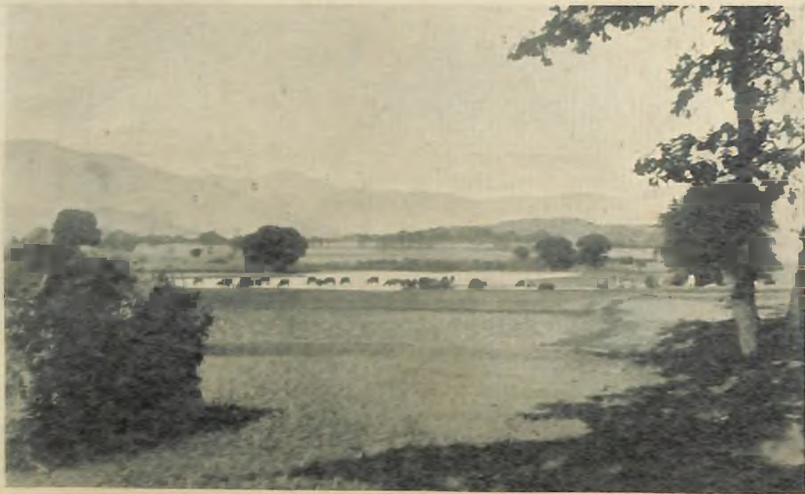
IN THE HEART OF THE DAMAN-I-KOH