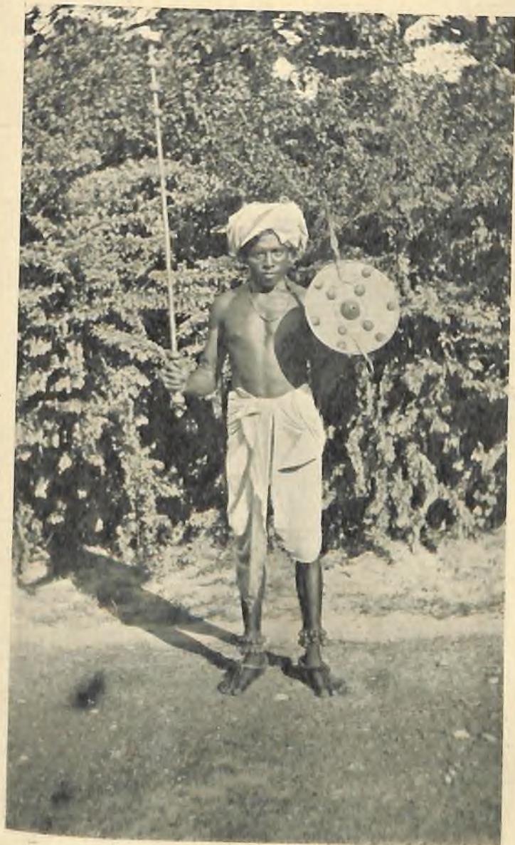
A SANTAL YOUTH FULLY EQUIPPED FOR THE DANCE