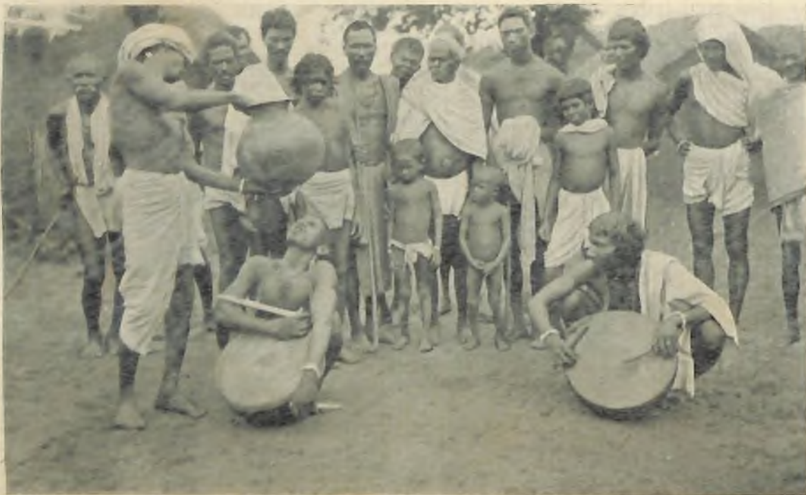
MUSICIANS BEING REFRESHED WITH LIQUOR DURING THE PROGRESS OF A FESTIVAL