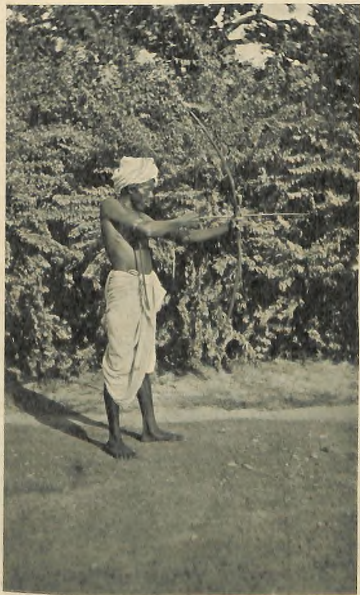
A SANTAL SHOOTING