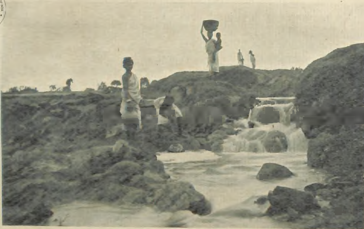
A TYPICAL SCENE IN THE RAJMAHAL HILLS