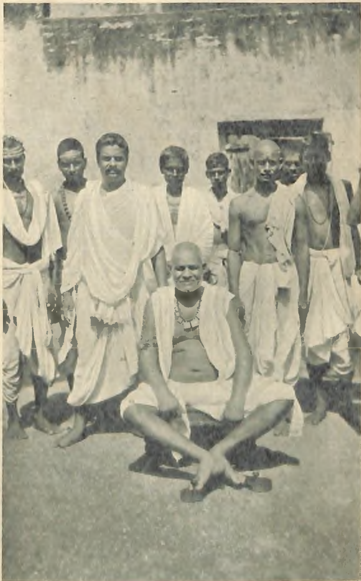
THE HIGH PRIEST OF DEOGHAR