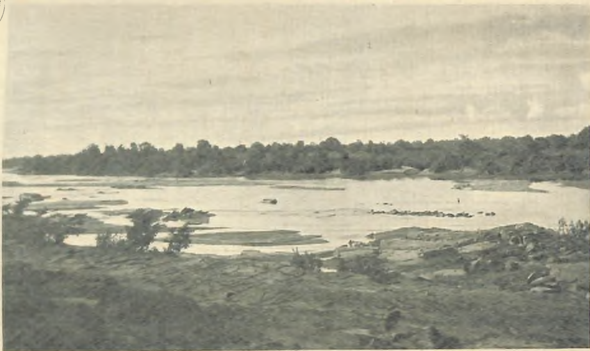
THE DAMUDA: THE SACRED RIVER OF THE SANTALS