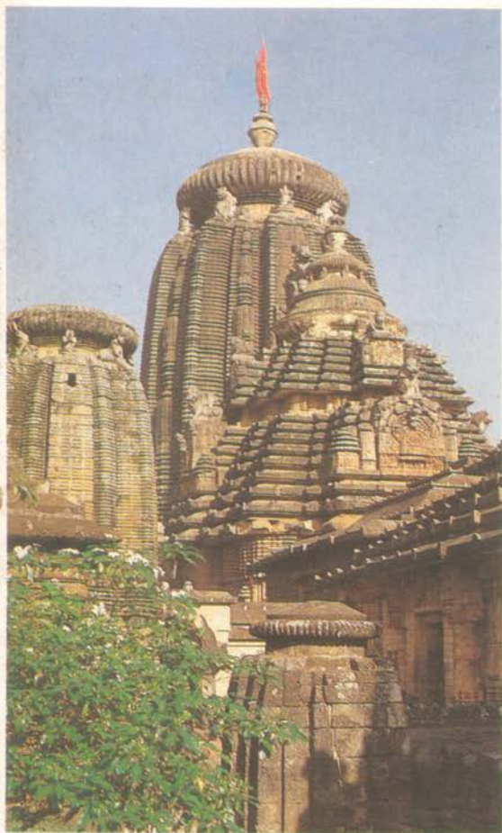
Lingaraj Temple, Bhubaneswar