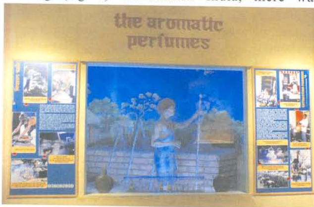
Fig. 6. Diorama depicting the ancient Indian perfume making process using the reverse hydro distillation techniques

alchemical laboratory of Nagarjuna which is portrayed in the Gallery, shows a number of special types of yantras , used for different chemical purposes like distillation ( patanayantra ). One of the most important yantras the tiryakapatanayantra (reverse distillation) was used in zinc smelting and also in the perfume making (fig 6). In ancient India, there was