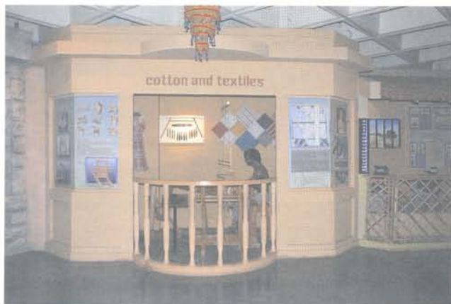
Fig 9. Exhibit display showcasing ancient Indian cotton and textiles with information on cotton-gin and also a model of the same in the inset along with other display

the significance of cotton, cotton-gin and also the rich traditional textile heritage that India has. The exhibit also houses a model/replica of an ancient cotton gin made from the references of Needham's book.