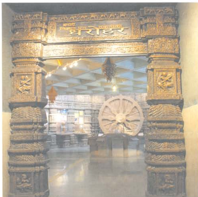
Fig..1 The entrance view of the gallery showing inset display of the section on ancient astronomy

The gallery starts with a presentation that is a wonderful mix of both the science centre and museum approach (Fig1&2). A large size mural