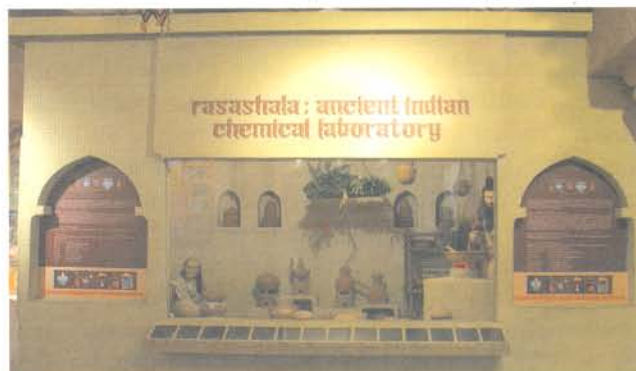
Fig. 5. Exhibit showing a typical period setting of an ancient chemical laboratory the Rasashala

Alchemy (the older form of chemistry) is another area in which ancient Indians made profound contributions 13 . It is interesting to note that Joseph Needham claims that earliest distillation of alcohol can be traced back to the archaeological finds at Taxila 14 . Much of ancient chemistry in India grew out of the early efforts to develop an elixir and to turn base metals into gold. The Indian alchemy had two characteristic streams: gold making and elixir synthesis. The two faces of the alchemical practice, the metallurgical and the physico-religious, were superimposed to get a single picture wherein mercury and its elixirs were used in the so-called transmutation of the base metals into noble ones, as well as for internal administration for purifying the body, rejuvenating it and taking it to an imperishable and immortal state. The earliest available documented alchemical text in Sanskrit, Rasaratnakara by Nagarjuna was probably part of a larger text Rasendramangala written by the same author. Nagarjuna was the most prominent scholar in the field of Indian alchemy. Rasashala (fig 5), a typical