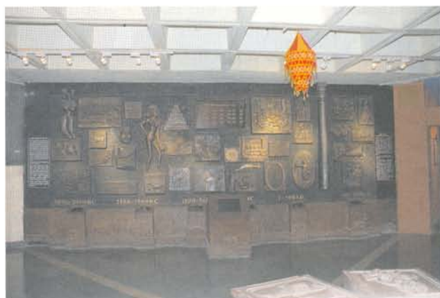
Fig. 2. Time line of our S&T Heritage mural exhibit in the entry area showing 6 landmark time lines with supporting digital photo frames and a touch screen multimedia