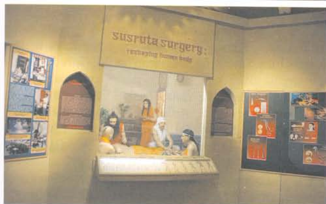
Fig 7 Diorama showing a typical surgical laboratory of Sushruta, with supporting information and display materials

Of the several media coverage that the gallery received in the print and electronic media one that stands out is the coverage on Sushruta's surgery. Just after the inauguration of the gallery a press correspondent from AFP, of all things from the gallery, picked up the Nose Job of Sushruta and filed his report and his report was picked up and published by several international and Indian print medias 16 and the coverage credited India (Sushruta) to be the first to carry out the plastic surgery with specific reference to the rhinoplasty, besides touching upon the other highlights of the gallery.