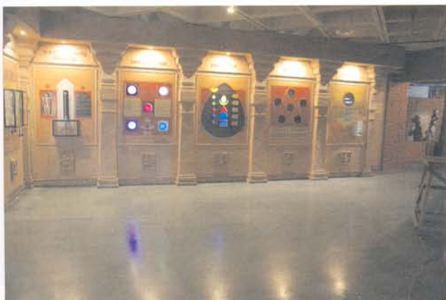
Fig 4. A general view of the section on Ancient Indian Philosophical concepts and contributions in mathematics

important idea that appears so simple now that we tend to ignore its true merit. George Sarton, the renowned historian of science, known for his work, Ancient science through the golden age of Greece , Cambridge, Harvard University Press, 1952, has observed: Our numbers and the use of zero were invented by the Hindus and transmitted by Arabs; hence the name Arabic numerals which we often give them. Al-Khwarizmi (9 th century AD), a Central Asian mathematician who worked in Baghdad, played a crucial role in transmission of the Hindu works to the western world through his seminal work on arithmetic. Al-Biruni (11 th Century AD) 12 was another exponent not only of the Hindu numerical system, but also of Indian astronomy. Other important Indian contributions that have been adequately covered in this section of the gallery include calculation of the value of pi, and calculating the square and cube roots of numbers, the golden rule of three, Brahma Gupta's important contribution in the solution of second order indeterminate equation that was later recognized by Europe as the Pell's equation. His lemmas in this connection were rediscovered by Euler (1764) and Lagrange. The so-called Pythagoras theorem also seems to have been worked out by the Indians as evidenced in the Sulbasutra treatises and therefore the exhibition also covers this aspect which also has been presented in an interactive manner.