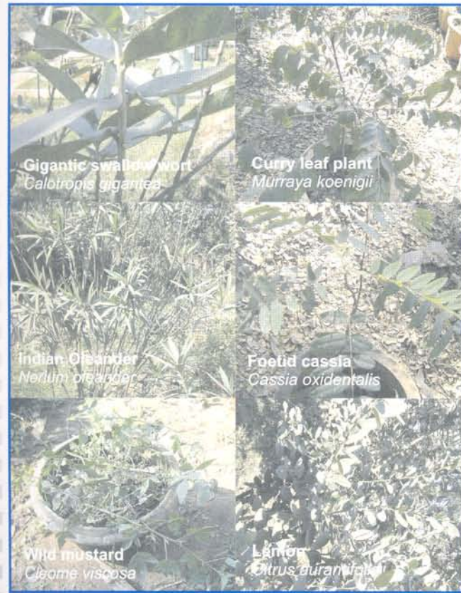
Fig. 4. Larval food plants