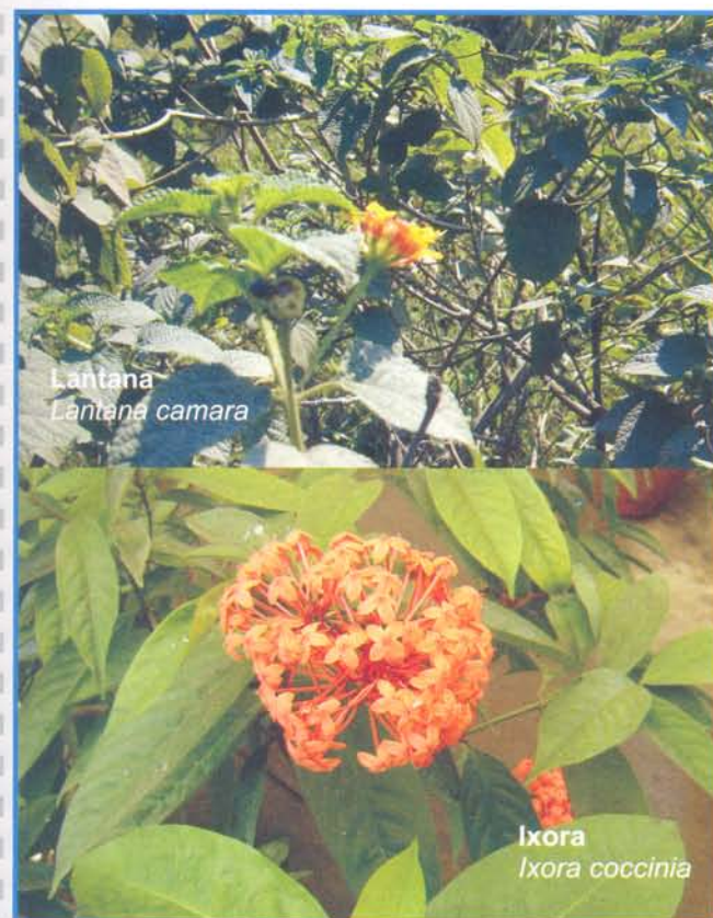
Fig. 5. Nectar plants

Handling techniques for hard species like common mormon, lime, plain tiger and common crow (strong species) are different from small and delicate species like psyche, common grass yellow. Species like common mormon, lime, plain tiger, blue tiger and common crow are relatively large in size, they are hardy in their body built and easy to handle where as species like common grass yellow and psyche are small in size and very delicate. Hard species caterpillars can be collected with our hands and can be reared in caterpillar boxes. Caterpillar boxes are stuffed with host plant leaves so that caterpillars get their food throughout their development.