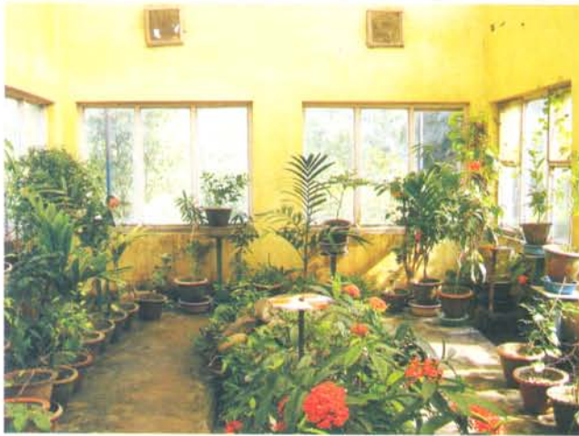
Fig. 2. Butterfly House (inside view)

climatic ranges gave best results when the caterpillars are growing and also during hatching of butterflies.