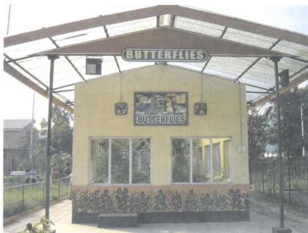
Fig. 1. Butterfly House (outside)

A 15' H x 30' L x 15' W butterfly house was built with transparent resin sheet on the roof to receive maximum natural sunlight. Temperature (28°C–32°C) and humidity (80%-90%) maintained in the butterfly house. All the doors and windows are fitted with stainless steel wire mesh. Mesh size of these nets are 2 mm so that no predators can enter inside the house. Inlet and exhaust fans are fitted to provide natural air flow inside the house. Butterfly house and nursery are fitted with metal halide lights to provide near day light conditions. Mud puddles, nectar feeders and flowery plants along with natural plants are arranged inside the house. Caterpillar and Pupa Nursery is fitted with